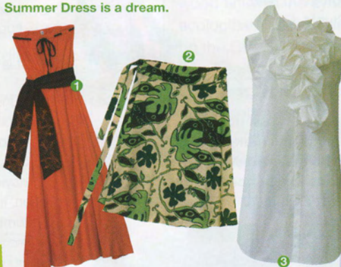
1 Delia Summer Dress, 100% organic cotton, £38

People Tree is a pioneering Fair Trade and ecological fashion company, working with 50 Fair Trade groups in developing countries. Its stringent fair trade and eco policy promotes traditional skills and rural development and protects the environment by using organic and ethical materials. The incredibly ethical, simple and stylish fashions are perfect to adorn on long sweltering summer holidays in faraway exotic locations. If you want to be on trend, the Richard Nicoll Shirt adds an element of the New Romantic with its fabulous frills. And since every girl needs a maxi dress in her wardrobe this summer, the Delia Summer Dress is a dream.