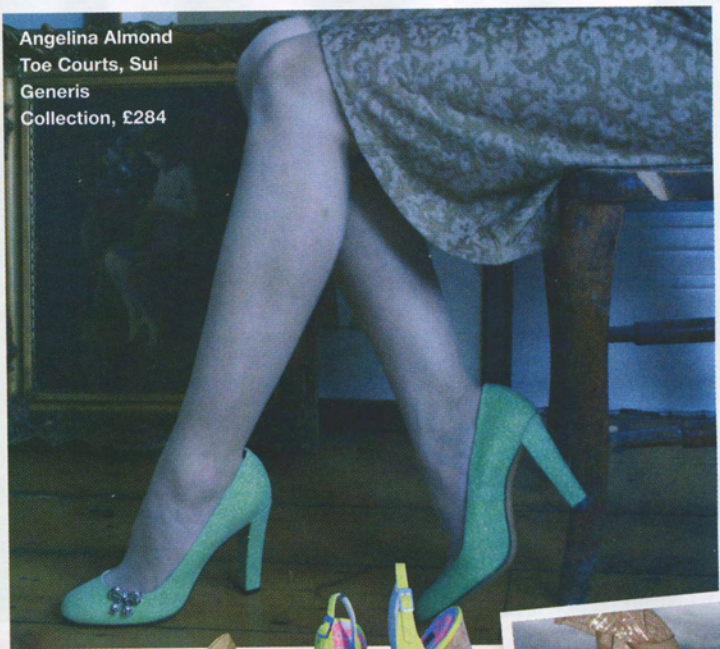
Angelina Almond Toe Courts, Sui Generis Collection, £284

Kuyichi was the first denim label to use organic cotton and ecological processes. The name Kuyichi is derived from the Peruvian god of the rainbow who, according to legend, stole the colours of life from the Taquile Indians and later restored the colours after the Indians wove beautiful blankets.