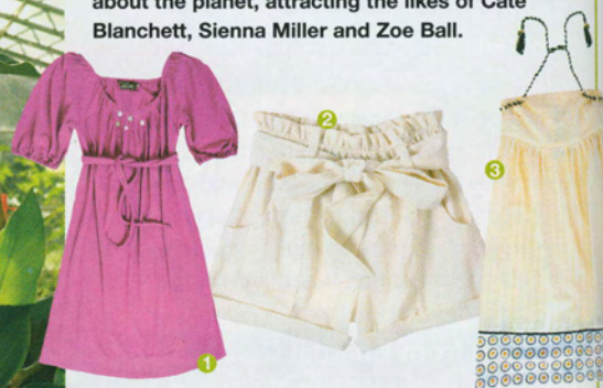
1 Sophia Dress in Foxglove, made from organic cotton jersey, £185