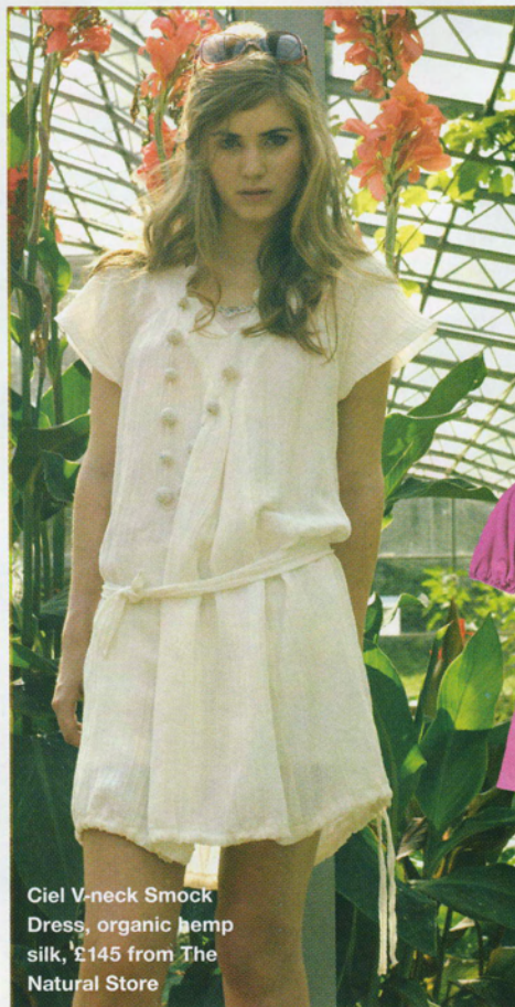
Ciel V-neck Smock Dress, organic hemp silk, £145 from The Natural Store