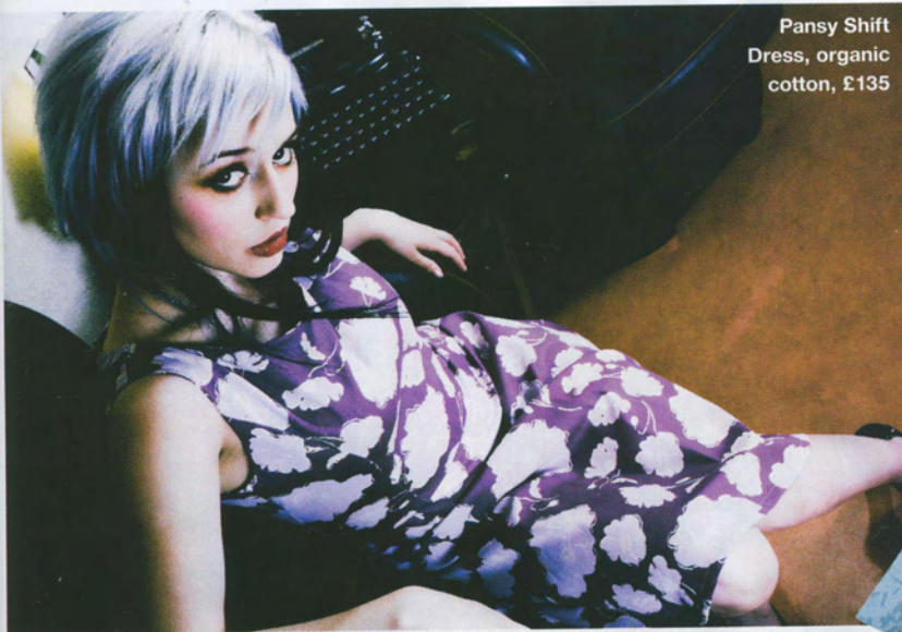
Pansy Shift Dress, organic cotton, £135