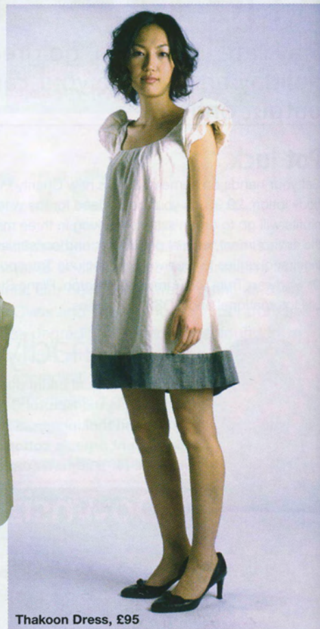
Thakoon Dress, £95

Go to ptree.co.uk ; also available at adili.com , thenaturalstore.co.uk , my-wardrobe.com