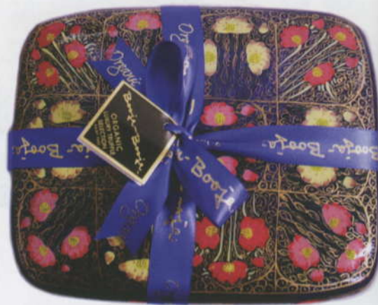
Booja Booja Handmade Luxury Gift Box, £37.99, Ethicalsuperstore.com.