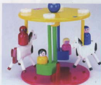
Wooden Roundabout, £32, Toys-to-you.co.uk.

Christmas wouldn't be the same without mouth watering choccies to nibble on, but now you can buy them without the obligatory guilt. These delicious chocolate truffles make a perfect gift and they are organic, vegan, and dairy, wheat, gluten and GM free to boot. The beautiful boxes are handpainted by traditional artists in Kashmir, who have gained a stable income for their families by working with Booja Booja.