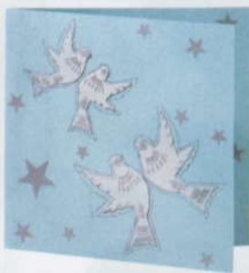
Traidcraft Dove Pop-up & Jewel Star Cards, £3 for two, Traidcraftshop.com.

These beautifully handcrafted cards are produced in Bangladesh by Prokritee and income earned from such craft sales help women in rural Bangladesh work their way out of poverty. Prokritee has been working in Bangladesh since 1972, aiming to create employment for disadvantaged rural women, setting up and running cottage industries with the intention of helping the groups become strong enough to be independent of the organisation. There are around 700 people, mostly women involved in making handicrafts and developing unique products.