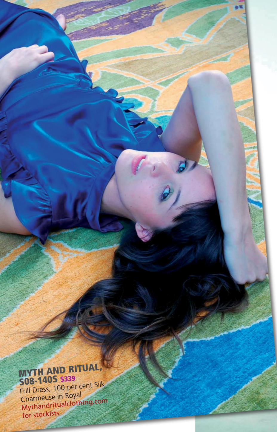
MYTH AND RITUAL, S08-140S $339 Frill Dress, 100 per cent Silk Charmeuse in Royal Mythandritualclothing.com for stockists