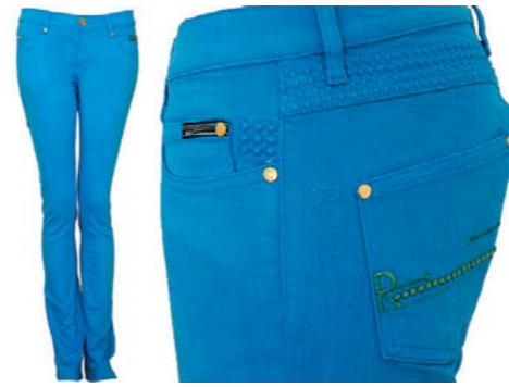
RUBY LONDON RENNIE SLIM LEG £130 China Blue, 98% Organic Cotton Rubylondon.com