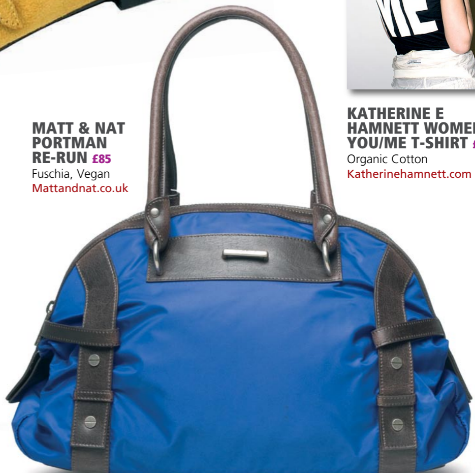
MATT & NAT PORTMAN RE-RUN £85 Fuschia, Vegan Mattandnat.co.uk