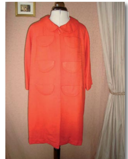
ELIZABETH'S VINTAGE CLOSET 1950S ZADA ORANGE £55 ¾ Sleeved Coat, Vintage Elizabethsvintagecloset.co.uk