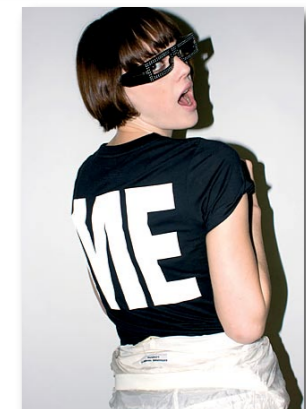
KATHERINE E HAMNETT WOMEN'S YOU/ME T-SHIRT £40 Organic Cotton Katherinehamnett.com