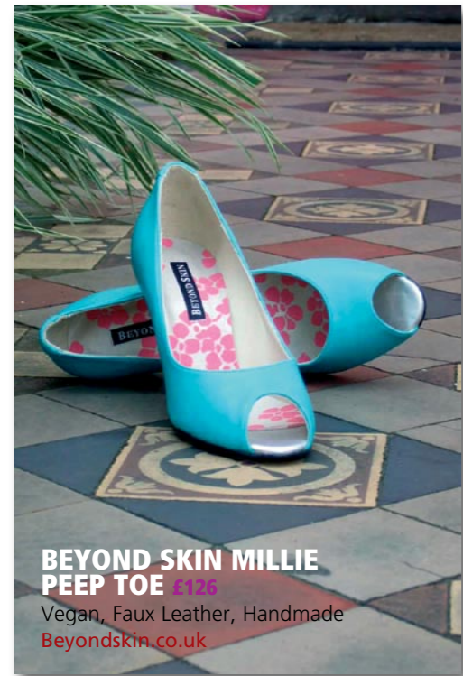
BEYOND SKIN MILLIE PEEP TOE £126 Vegan, Faux Leather, Handmade Beyondskin.co.uk