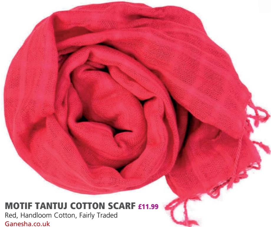
MOTIF TANTUJ COTTON SCARF £11.99 Red, Handloom Cotton, Fairly Traded Ganesha.co.uk