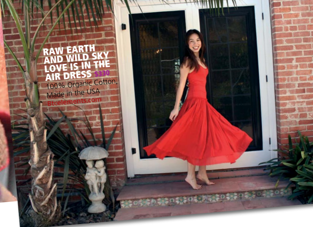
RAW EARTH AND WILD SKY LOVE IS IN THE AIR DRESS $390 100% Organic Cotton, Made in the USA Btcelements.com